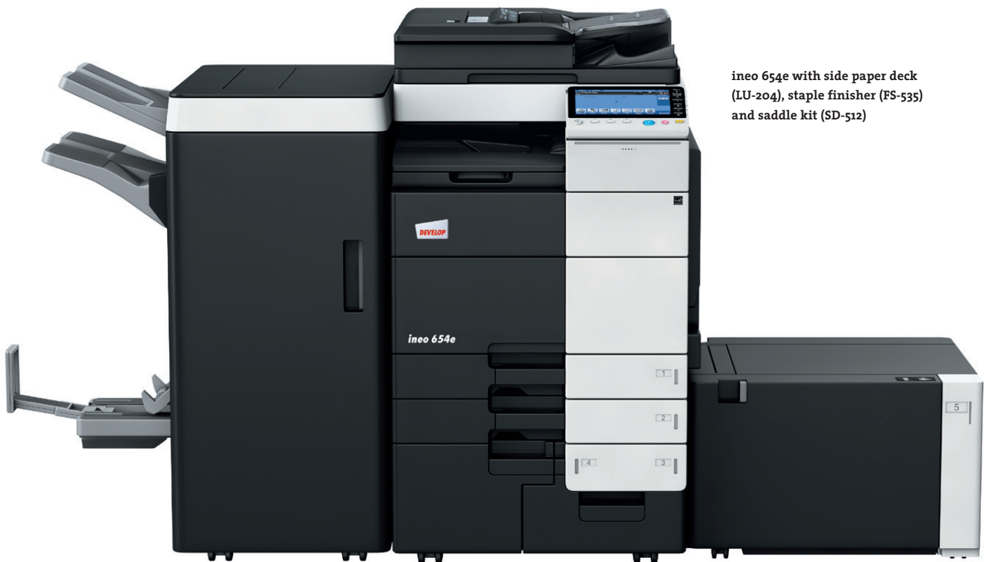
ineo 654e with side paper deck (LU-204), staple finisher (FS-535) and saddle kit (SD-512)

Viruses, Trojan horses, hacker attacks: these days, no business can afford to ignore the challenging issue of IT security. That's why the ineo 654e is certified to ISO 15408 EAL 3, the industry's security standard for multifunctional systems. What's more, it also comes equipped with numerous data-security features such as IPsec encryption, which ensures secure communication channels for all documents passing through your company's network. There is no danger of confidential documents or data getting into the wrong hands either since access to the system can be restricted to authorised users by means of the standard hard-disk encryption kit and authentication technology. This way, we ensure your sensitive data stay secure – now and in future.