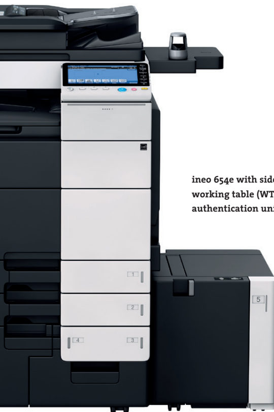
ineo 654e with side paper deck (LU-301), working table (WT-506) and finger vein authentication unit (AU-102)

The ineo 654e prints and copies at 65 A4 pages per minute (ppm). That means your staff can leave this machine to get on with any high-volume job while they carry on with their daily office work. In the multi-user environment of a departmental device or centralised office location and at an in-house printshop, this will also eliminate job queues, or at least shorten waiting times. Since this machine prints or copies in duplex mode at full speed, it will also save you money by reducing your paper consumption on high-volume jobs.